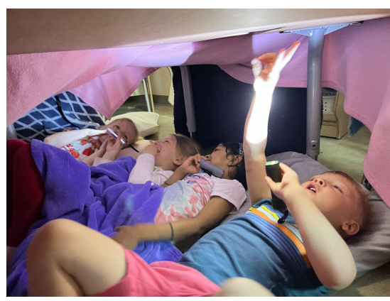
Our Fort Building Day was a blast! The students loved this reward!